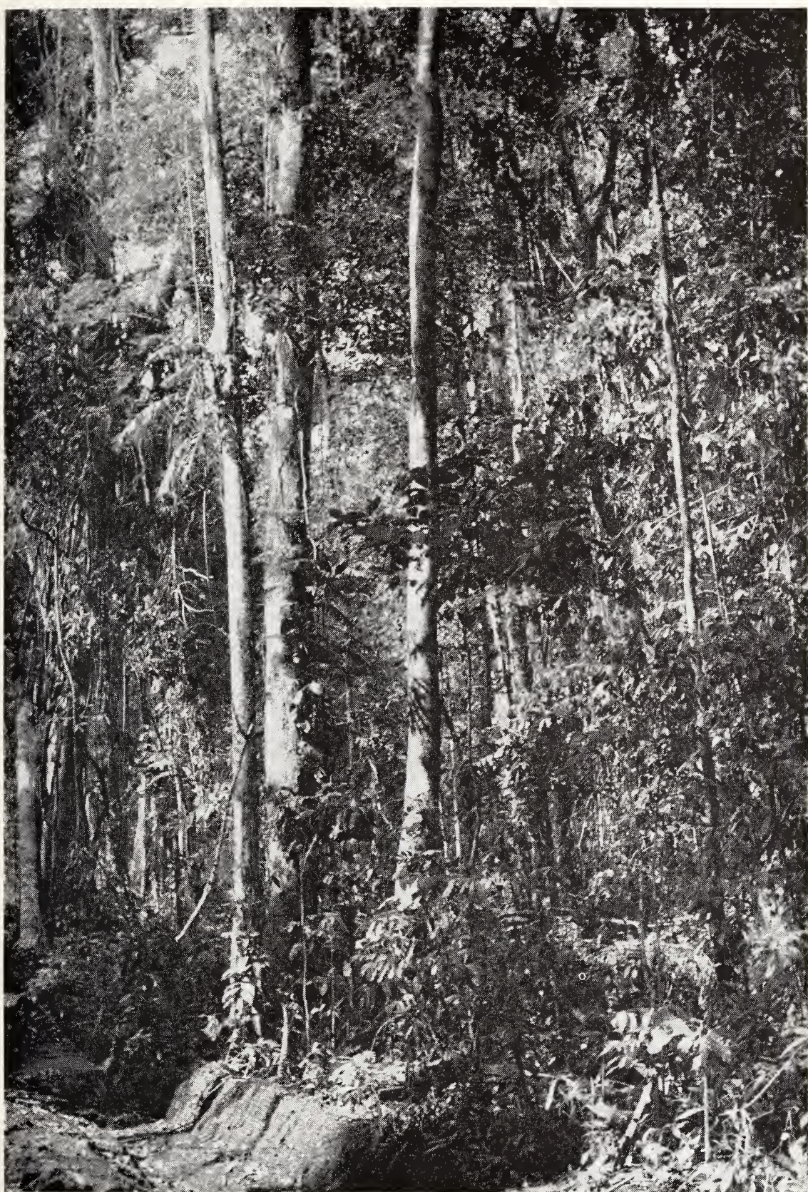
WILSON — NEW GUINEA RAIN FOREST